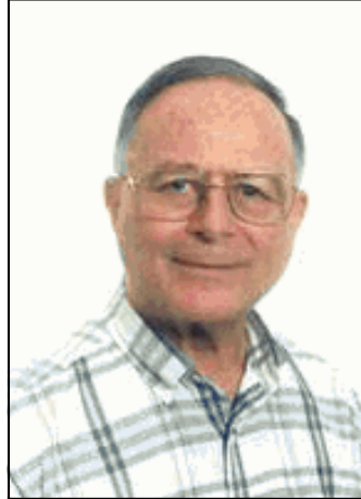
My daily prayers for you and your family.

Saturday night (6 p.m. in the Chapel) Sunday morning (10:30 a.m. in the Auditorium) Every Monday morning (7:15 a.m. in the Chapel) Every Wednesday morning (7:15 a.m. in the Chapel) Friday mornings (8:15 a.m. – dates scheduled on the Bulletin Board and also here in Chapel Chimes) Lent begin: ASH Wednesday, February 17 th , with Mass in the Chapel at 6:30 p.m.